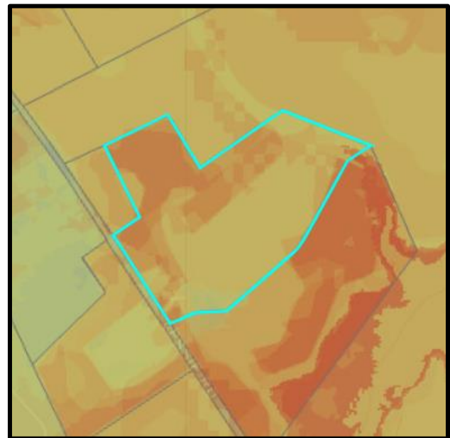
Parcel 40-4N-25-0000-0002-0000 Acres: 66.76 Base CLAM Score: 33.17