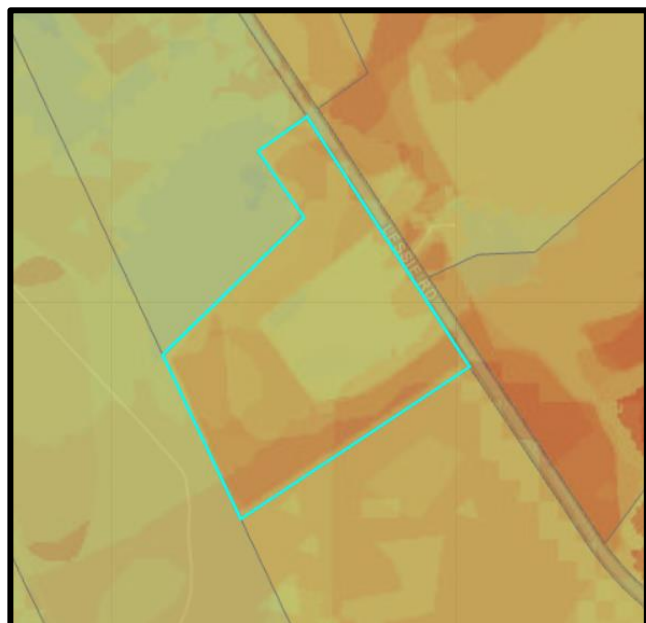
Parcel 40-4N-25-0000-0003-0010 Acres: 32.74 Base CLAM Score: 31.93