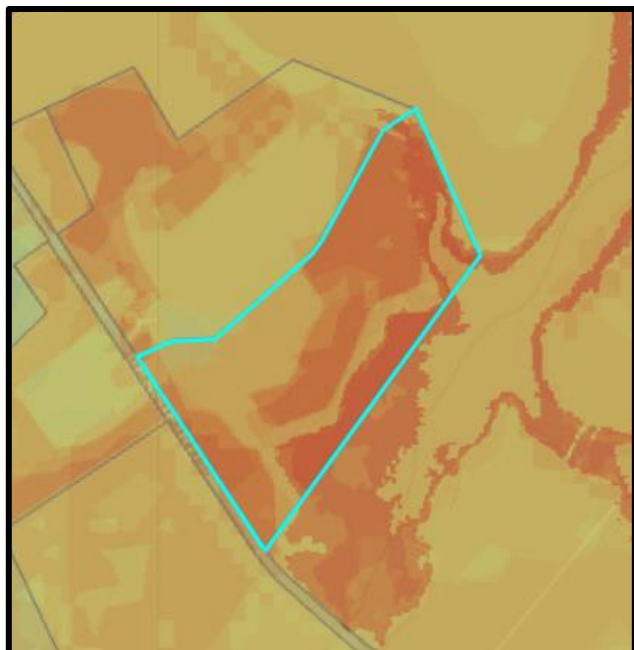
Parcel 40-4N-25-0000-0002-0010 Acres: 64.19 Base CLAM Score: 35.99