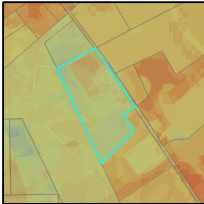
Parcel 40-4N-25-0000-0004-0000 Acres: 47.43 Base CLAM Score: 26.54